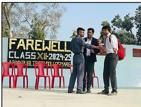
FAREWELL ASSEMBLY CLASS XI A & B