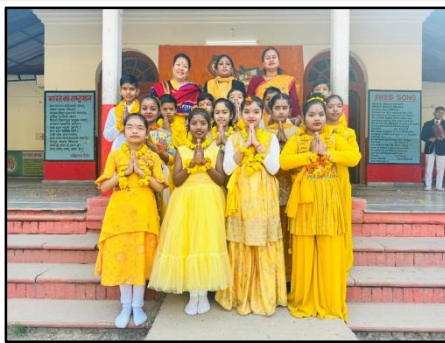
VASANT PANCHAMI NEHRU HOUSE