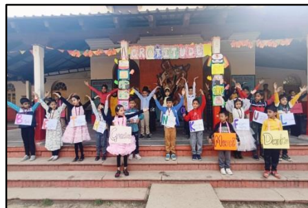
GRATITUDE CLASS I- B