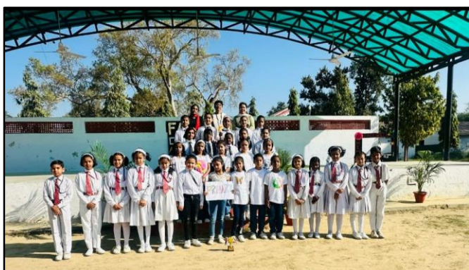
FAREWELL ASSEMBLY FOR CLASS V BY STUDENTS OF CLASS III & IV