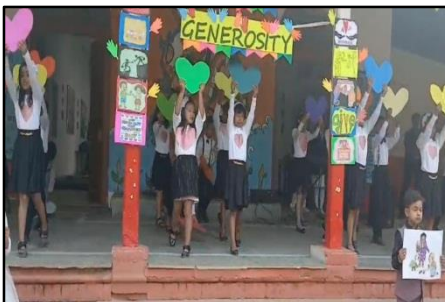
VALUE OF GENEROSITY CLASS I- C