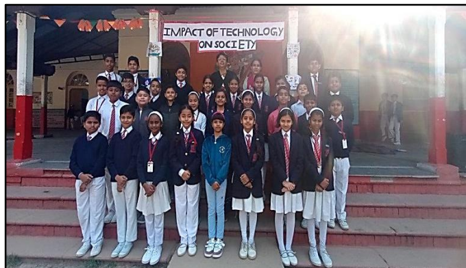
IMPACT OF TECHNOLOGY ON SOCIETY CLASS V-F