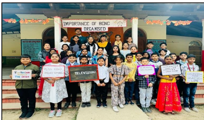
IMPORTANCE OF BEING ORGANISED CLASS V-G