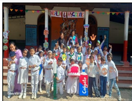
HEALTH AND HYGIENE CLASS I A