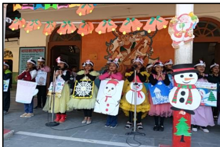
WINTER SEASON CLASS I - D