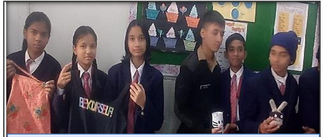
REPURPOSE & RECYCLING

As part of the ongoing initiatives to promote environmental awareness, two impactful activities were conducted on December 17, 2024, for the students of the school. These activities aimed to instill a sense of responsibility and practical understanding of sustainability and hygiene.