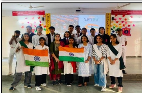
NAVY DAY BY CLASS IX – E & IX - F