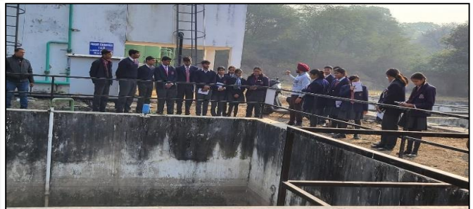
VISIT TO THE SEWAGE TREATMENT PLANT

Students visited the Sewage Treatment Plant at SKP (Surya Khel Parisar) to gain a deeper understanding of solid waste management and its role in public health and sanitation. They observed the various stages of the treatment process, including filtration, sedimentation, and purification. The visit emphasized the significance of sustainable practices in water management and the critical role of maintaining hygiene for a healthier environment.