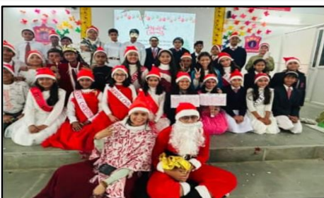
CHRISTMAS DAY BY CLASS VI - G