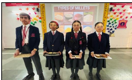
MILLETS DAY BY GANDHI HOUSE