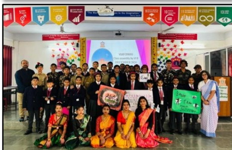
VIJAY DIWAS BY CLASS VI - B