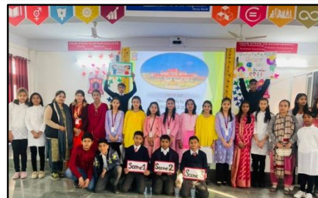
UNICEF DAY BY CLASS VI - A