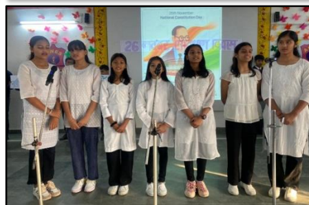
CONSTITUTION DAY BY CLASS VII-G