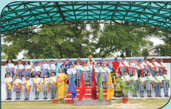
SCHOOL CABINET - PRIMARY

The School is dedicated to serve the highest interest of nation-building that can ensure vast synthesis of knowledge and harmonious perfection of the individual and collectivism.