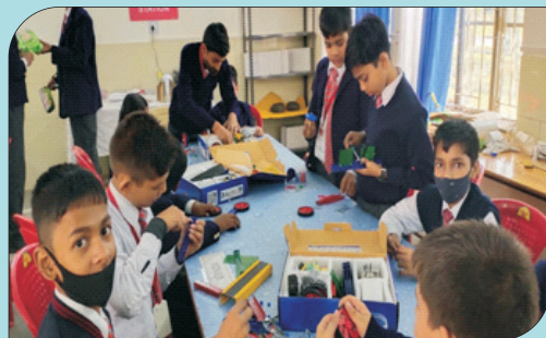
← ROBOTICS & TINKERING LAB