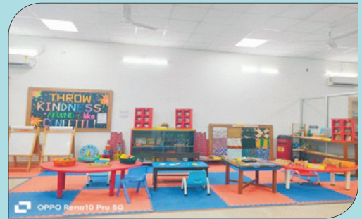
RESOURCE ROOM CwSN(PRE-PRIM)