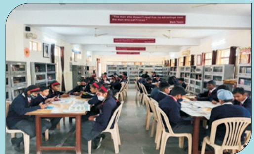
SCHOOL LIBRARY →