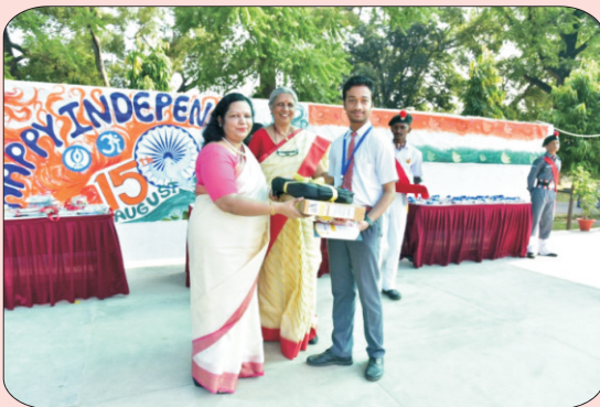
AWARDS AND ACCOLADES