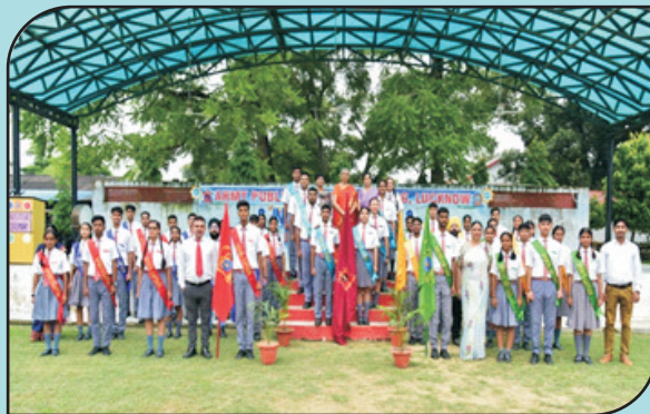
SCHOOL CABINET - SENIOR