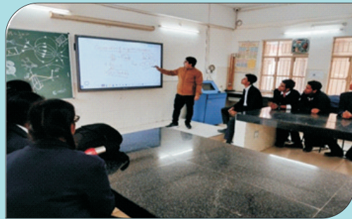
TAL EQUIPPED CLASSES

The school campus is designed to nurture young minds and to allow creative freedom. Each corner of the school, be it classrooms, playground, labs is specially designed to explore the imagination and expression for conducive learning