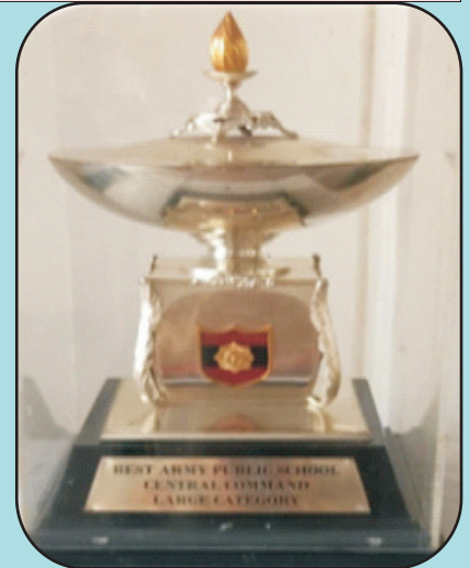
SCHOOL AWARDED WITH BEST ARMY PUBLIC SCHOOL TROPHY CENTRAL COMMAND IN LARGE CATEGORY AT ANNUAL COMMAND PRINCIPALS' MEET AT APS LBS MARG, LKO

Education's purpose is to replace an empty mind with an open one.