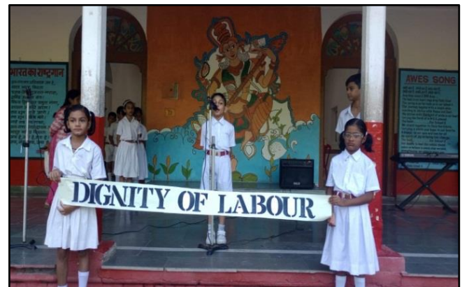
DIGNITY OF LABOUR BY CLASS 3B