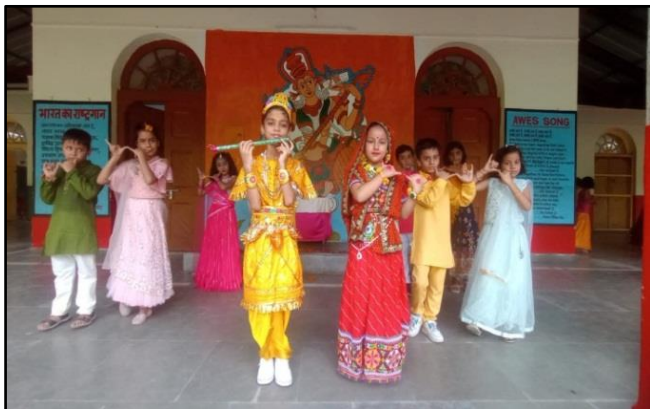
JANMASHTAMI BY CLASS 3E