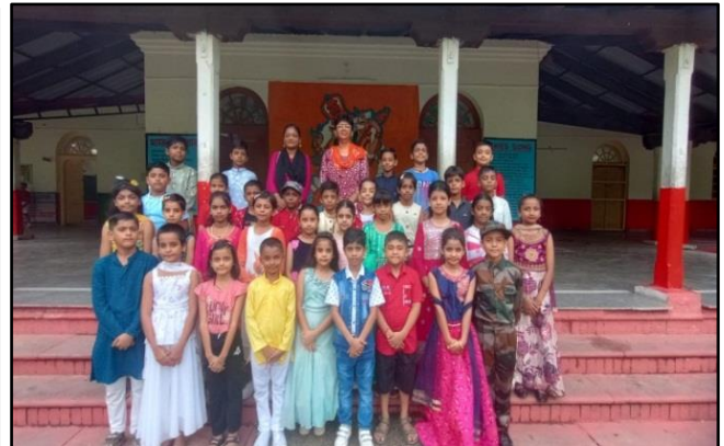
RAKSHABANDHAN BY CLASS 3D