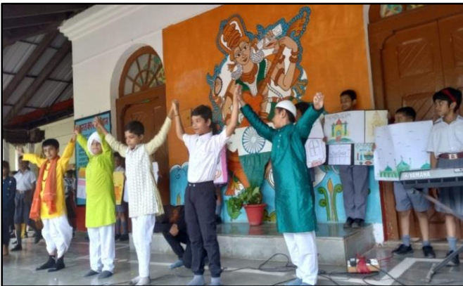
INDIA: HOME TO ALL RELIGIONS BY CLASS 3B